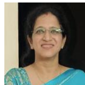
Sangeeta Semwal Ministry of Electronics and IT (MeitY), Government of India